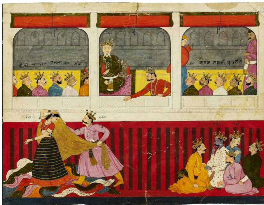
The disrobing of Draupadi, a miniature of the Basohli School, attributed to Nainsukh, c.1765

of the victimized is contrasted with the blind greed of the oppressor and the lack of conviction in the legitimate protector. The individual who explores this archetypal drama with authenticity enters the universal motifs of human suffering. Such engagement with one's duHkha is deeply insightful and healing. The stage is thus set for an honest introspection of one's inner patterns of feeling and thought as well as one's outer patterns of action.