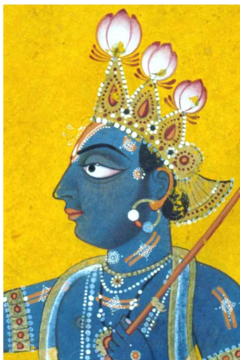
Krishna, artist unknown, Himachal Pradesh, India, c. 1730