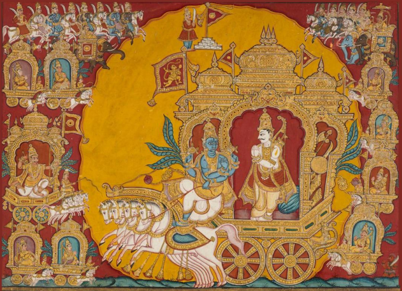
Krishna and Arjuna on the battlefield of Kurukshetra, artist unknown, 19 th cent. Mysore painting

A deep dive into the world of archetypes