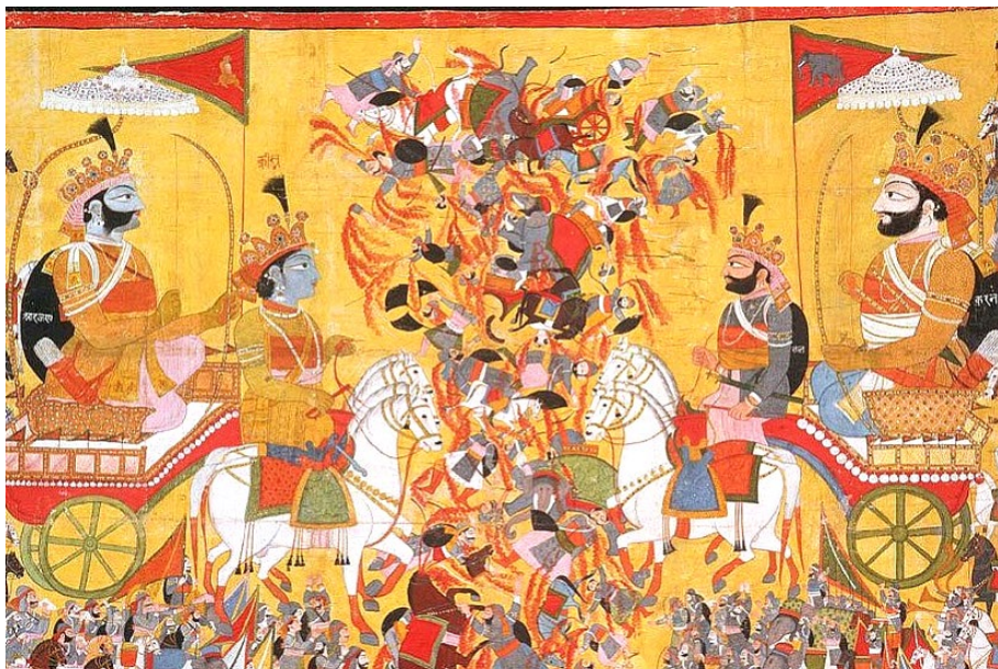
The battle of Kurukshetra- Arjuna faces Karna, artist/maker unknown, circa 1820,